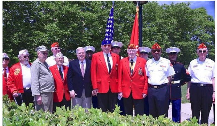
Governor Hogan with Korean War Veterans, Memorial Day 2015

Larry Hogan, Governor The State of Maryland